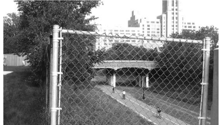
On the left side of this photo, notice the space where a walkway could go east of Park Avenue.

The creation of walkways or promenades along the north or south street-level rim of the Greenway have long been supported by the community, city, county, and businesses. This cooperative effort of the Coalition and Phillips West is funded