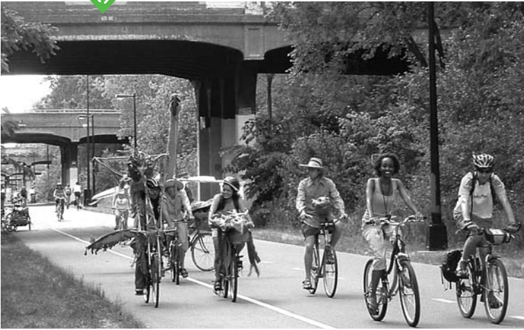
Artful bikes ride the Greenway during 2007 Global Bike Days.

Sunday June 22, from 10-6 at the Midtown Global Market