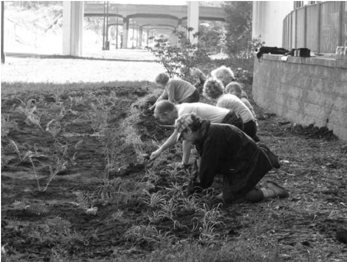
Allina volunteers help plant the Midtown Exchange Rain Garden.