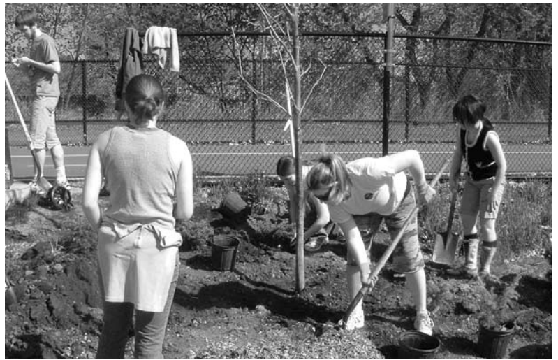
Volunteers help plant trees at the 2007 Arbor Day event along the Greenway.

Please ride your bike if you can! Bicycle parking will be available on site. Automobile parking will be available at The Green Institute.