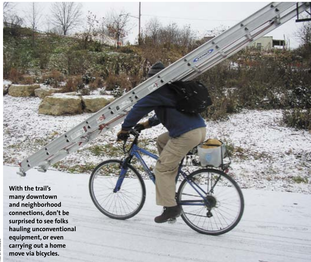
With the trail's many downtown and neighborhood connections, don't be surprised to see folks hauling unconventional equipment, or even carrying out a home move via bicycles.