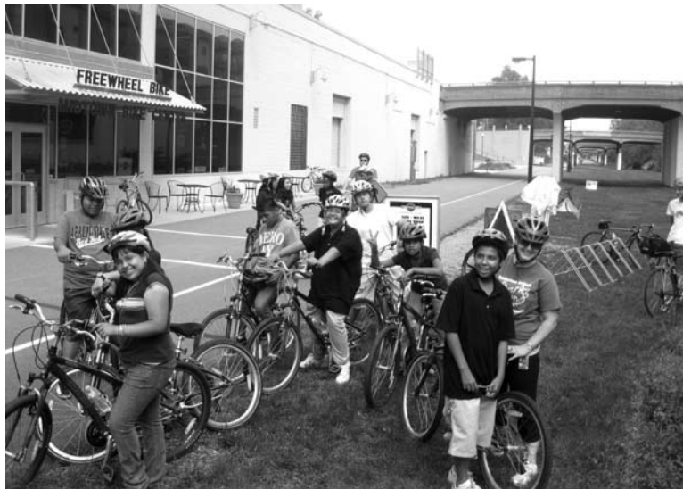
Andersen School kids get ready for a bike ride through the Greenway to Lake Calhoun.