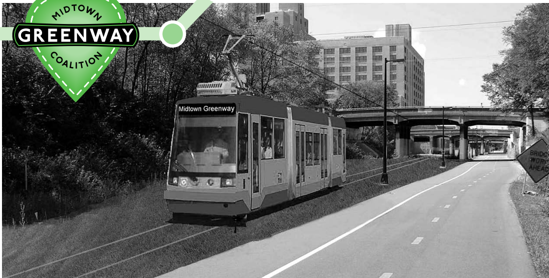
This rendering shows what electric streetcars would look like in the Midtown Greenway.